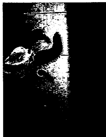
F149 drawer catches are self-locking and will secure most drawers on metal runners.